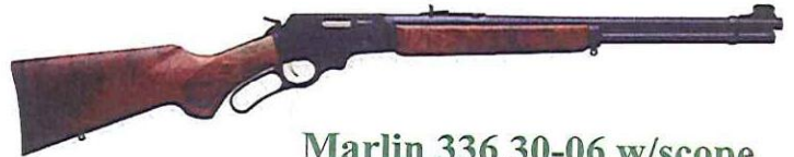
Marlin 336 30-06 w/scope