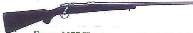
Ruger M77 Hawkeye standard .22-250