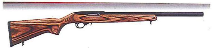
Ruger K10/22T Target Lam. Stainless Brown Laminate .22