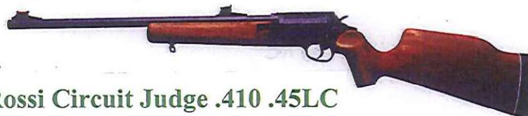
Rossi Circuit Judge .410 .45LC