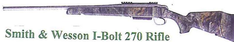
Smith & Wesson I-Bolt 270 Rifle