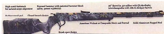
Thompson Center Encore .50 cal. Muzzle loader