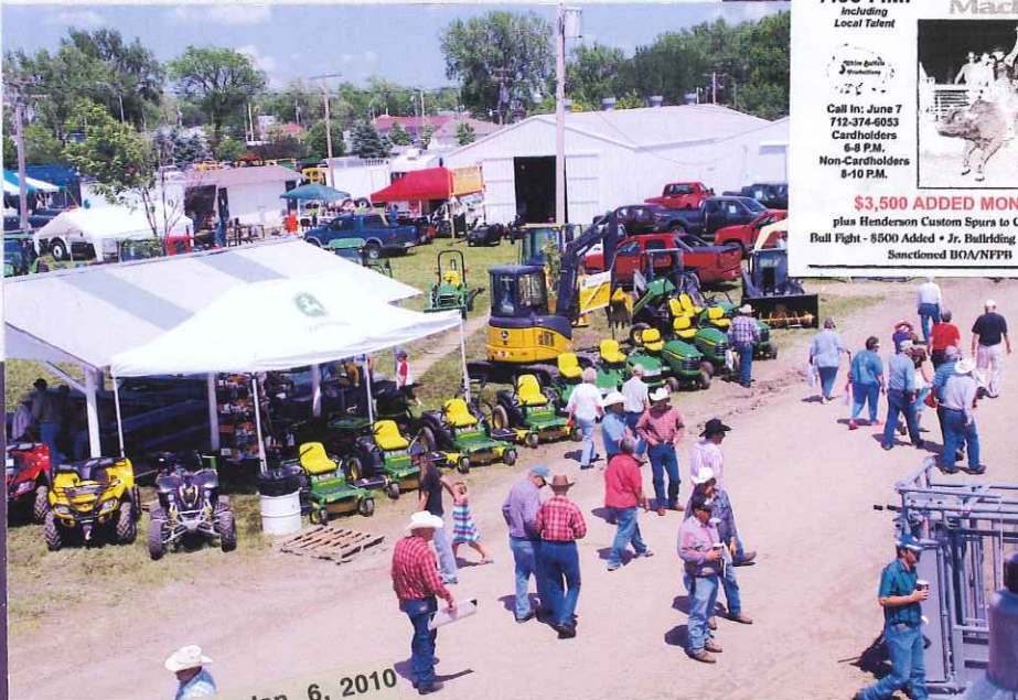
Rock County Leader, Bassett, Neb., Wednesday, Jan. 6, 2010

A hand of appreciation was given at the end of the evening, showing support for the plans to keep a ranch show at the Rock County Fairgrounds for the future.